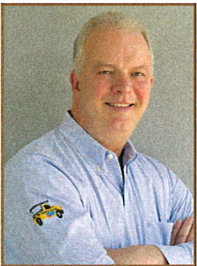
From the Desk of Dan Worstell